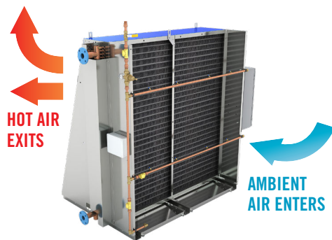
Adiabatic mist cools ambient air as needed (VIRGA Cirrus only)